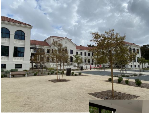
West LA VAMC Ribbon Cutting: May 2, 2023