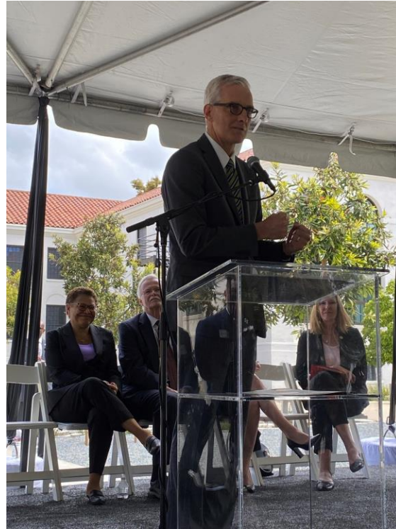
VA Secretary McDonough