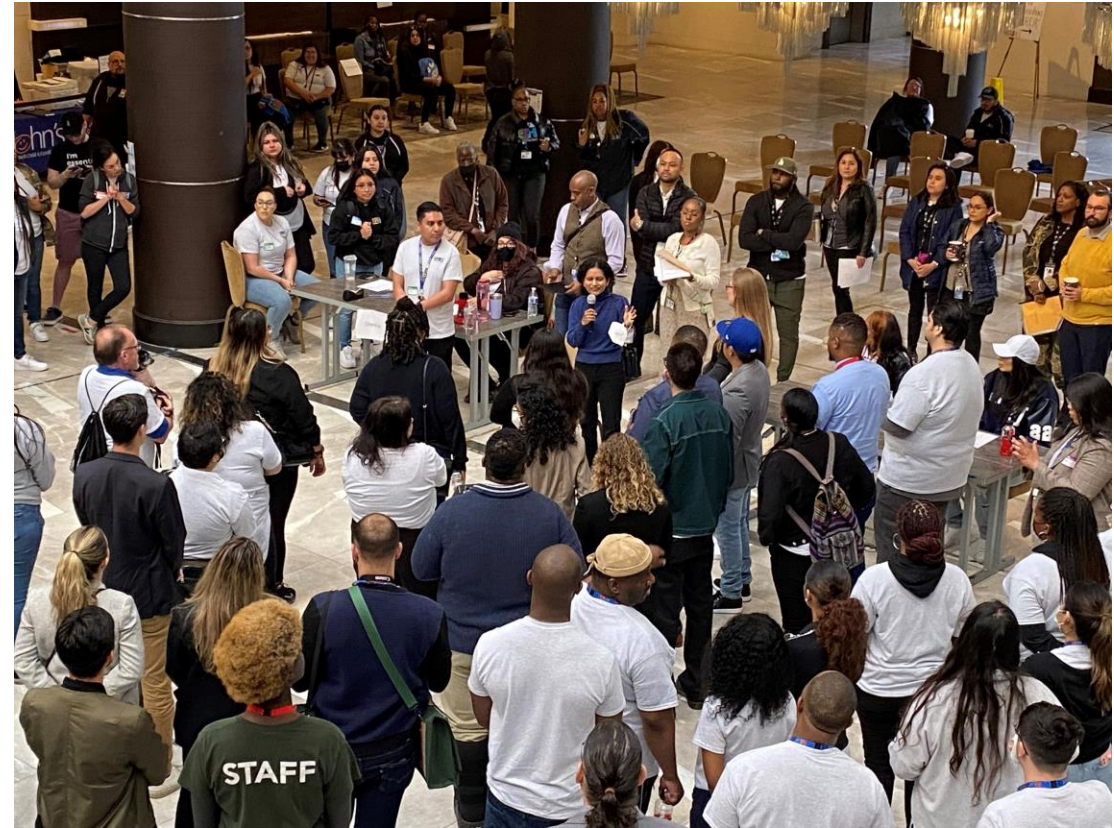
Cal ICH Mobile Homeless Connect: May 2, 2023 at the LA Grand Hotel